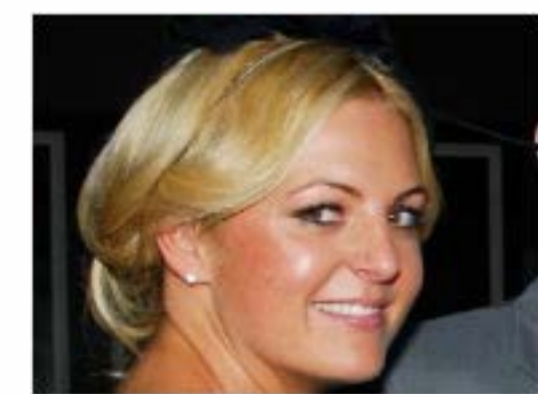
Tragic end for unlucky-in-love celebrity Sydney stylist